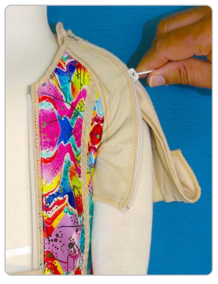
STEP 2: Do up the shoulder zips first. Ensure the fabric lining behind the zip is flat against the skin before the zip is done up.