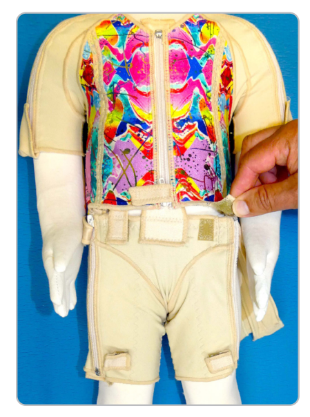
STEP 4: Connect the top and bottom half of the splint using the Velcro tabs before doing up the leg zips. Ensure the crotch section of the splint is centred over the client's crotch.