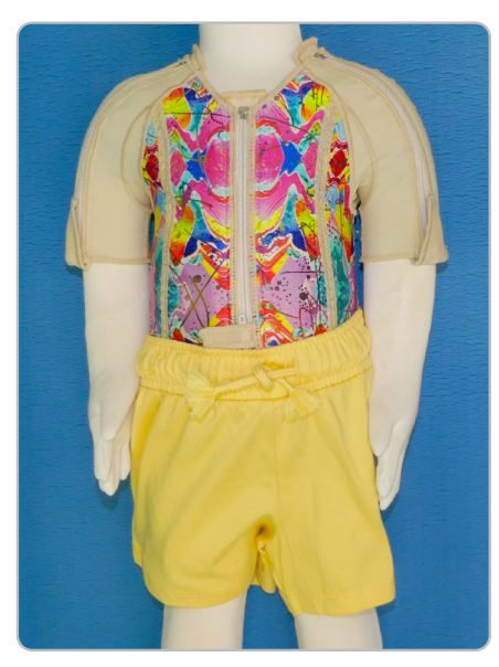
Some splints are designed with an open crotch for independence in toileting, so outerwear can be worn on top of the splint as shown.