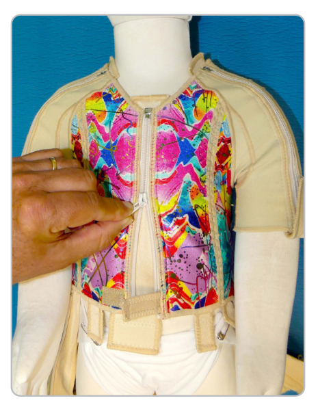
STEP 3: Gently push the client up into the shoulders of the splint to ensure good contact, before doing up the centre front zip (starts either at top or bottom). If the client has an abdominal feeding tube the splint will contain a pouch for ease of access. Ensure this pouch is centred over the tube before doing up the centre front zip.